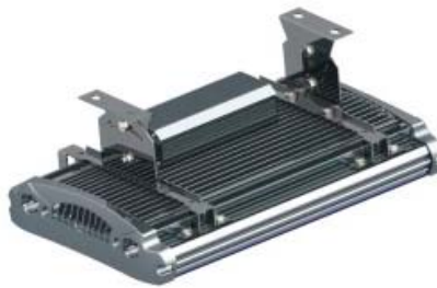
Adjustable Mounting Brackets (Standard)