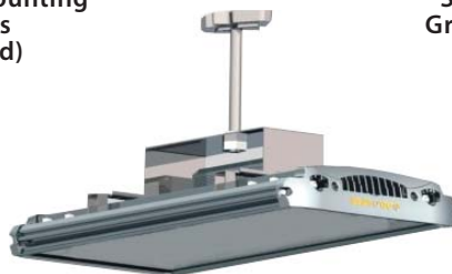
Pendant Mount 3/4" K.O. (PDM) Pendant Not Included