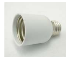
(E26A) IOP-E40-E26-EXTENDER Mogul to Medium Base Adapter

* Contact Factory for Application Verification.