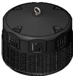
Hook Mount (Standard)