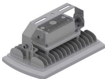
Adjustable Yoke Mount