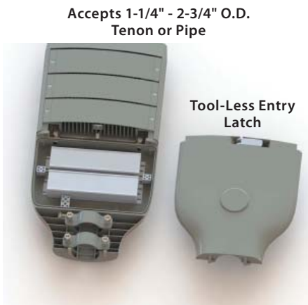
(2) Mounting Clamps (4) Stainless Steel Fastening Bolts