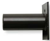
Square Pole Adapter SPA (sold separately)