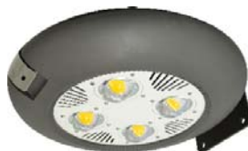
Wall Mount Bracket WMB (sold separately)