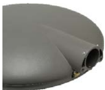
1-3/4" I.D. Accepts 1-1/4" - 1-1/2" O.D. Tenon or Pipe (standard)