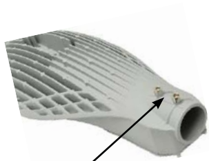
(2) 5-16" Stainless Steel Hex-head Bolts