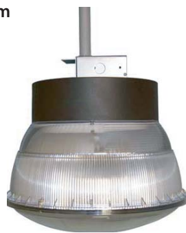
Pendant Mount to Junction Box