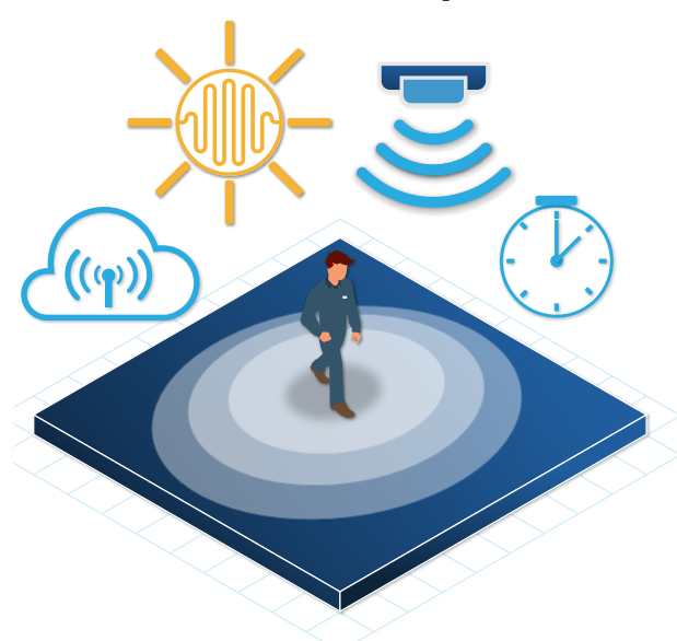
Compatible with controls and integrations