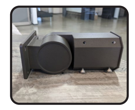
Slip Fitter Mount