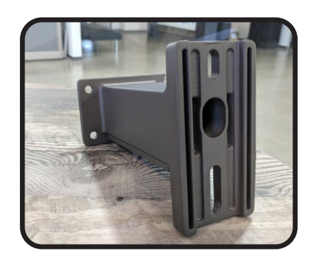
6" Extruded Arm Mount