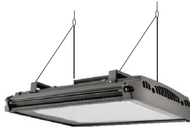
Supplied with Gripple Hangers (GPPL)