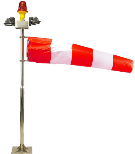
External Illumination Type