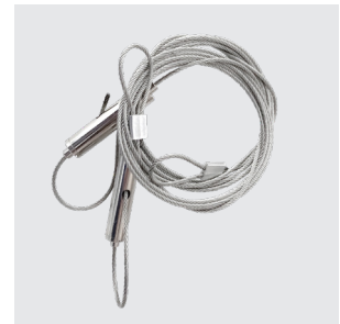
PT-LSL-A-HW Hanging wire for strip light