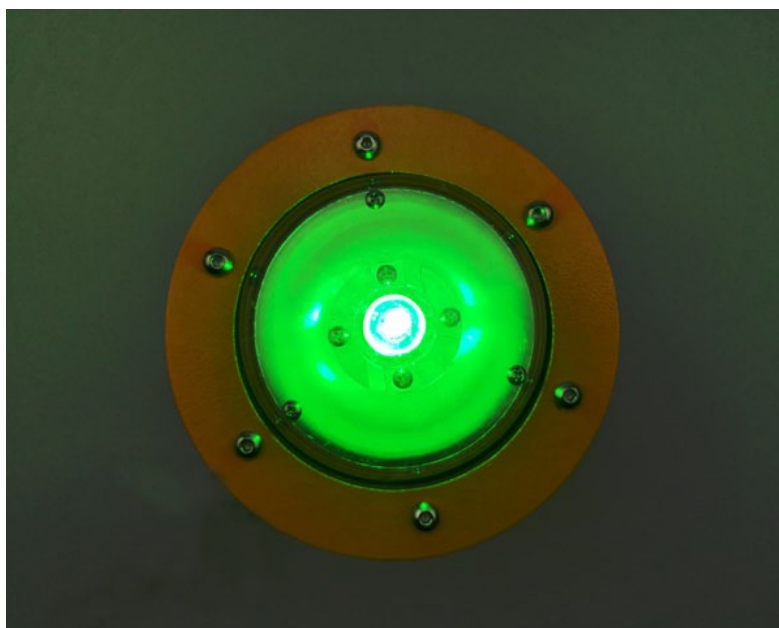
LP1 Green Perimeter Light Steady